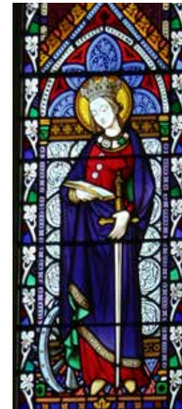
St Catherine at Bearwood