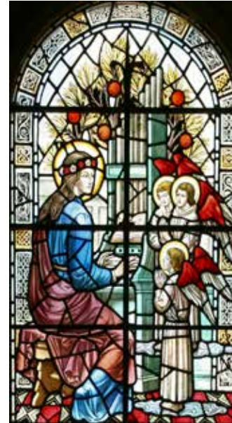
St Cecilia at Shefford Woodlands

St George, the patron saint of England, is usually shown in armour, killing a dragon, his red cross on a white background displayed on his surcoat or banner. He is