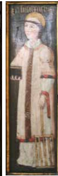
St Lawrence at Bisham