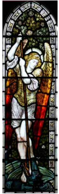
St Michael at West Woodhay

martyrdom - the spiked wheel of St Catherine, the flaying knife of St Bartholomew, the gridiron of St Lawrence, and the stones of St Stephen. St James the Less, who was beaten to death by a mob, is shown with a club, whereas St James the Great has a pilgrim's hat and a scallop shell.