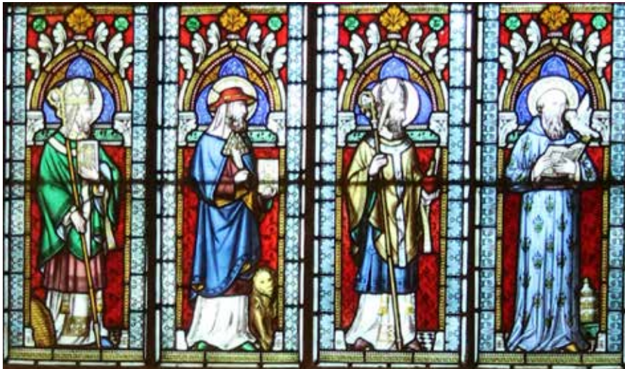
SS Ambrose, Jerome, Augustine and Gregory at All Saints, Boyne Hill

Mark | Luke Matthew | John on the reredos at Brightwalton the early church; Ambrose (often in episcopal robes with a beehive), Jerome (wearing a Cardinal's hat, with a lion), Augustine (a bishop, holding