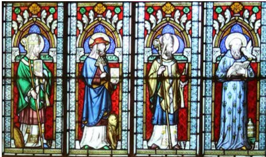
SS Ambrose, Jerome, Augustine and Gregory at All Saints, Boyne Hill

Mark | Luke Matthew | John on the reredos at Brightwalton the early church; Ambrose (often in episcopal robes with a beehive), Jerome (wearing a Cardinal's hat, with a lion), Augustine (a bishop, holding